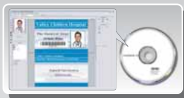
Free Bundle Software