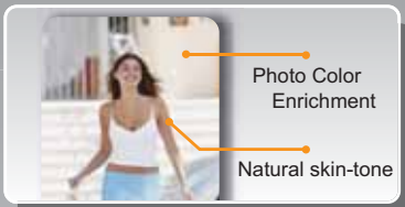
Retransfer Color Performance at Direct Print to Card Technology